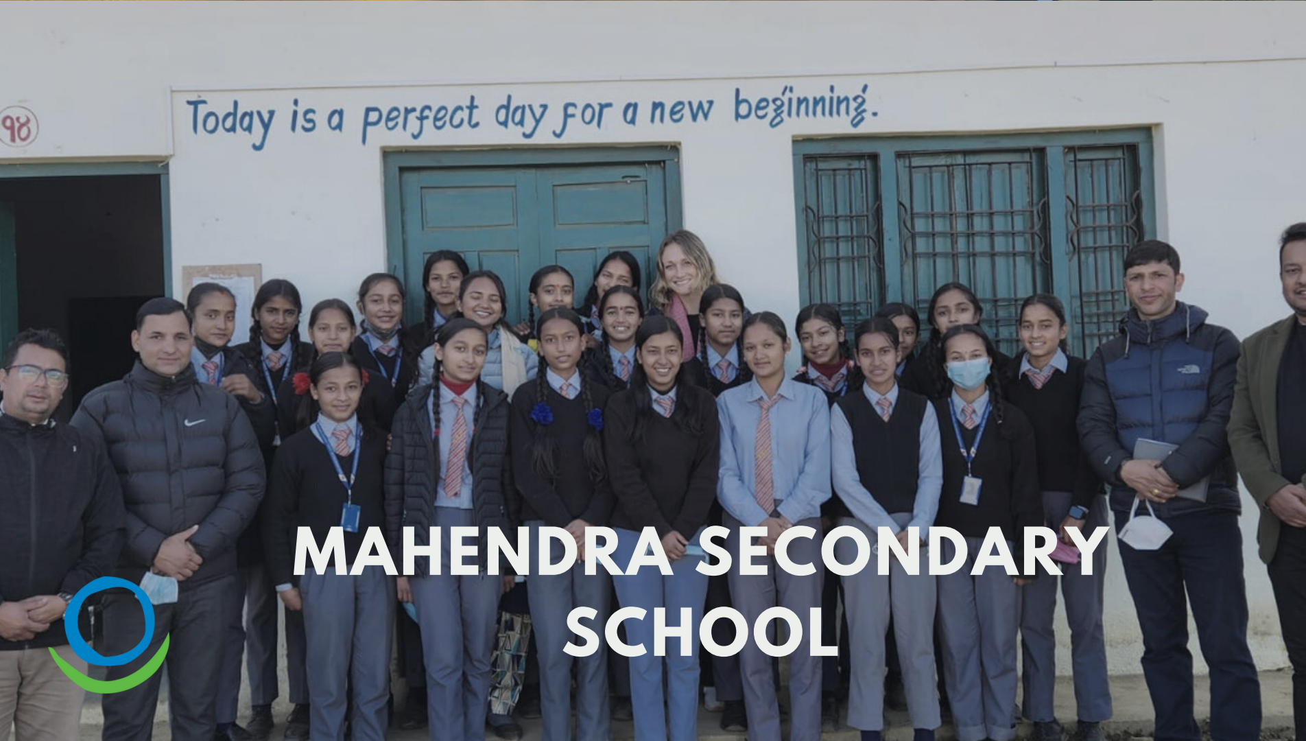
MAHENDRA SECONDARY SCHOOL