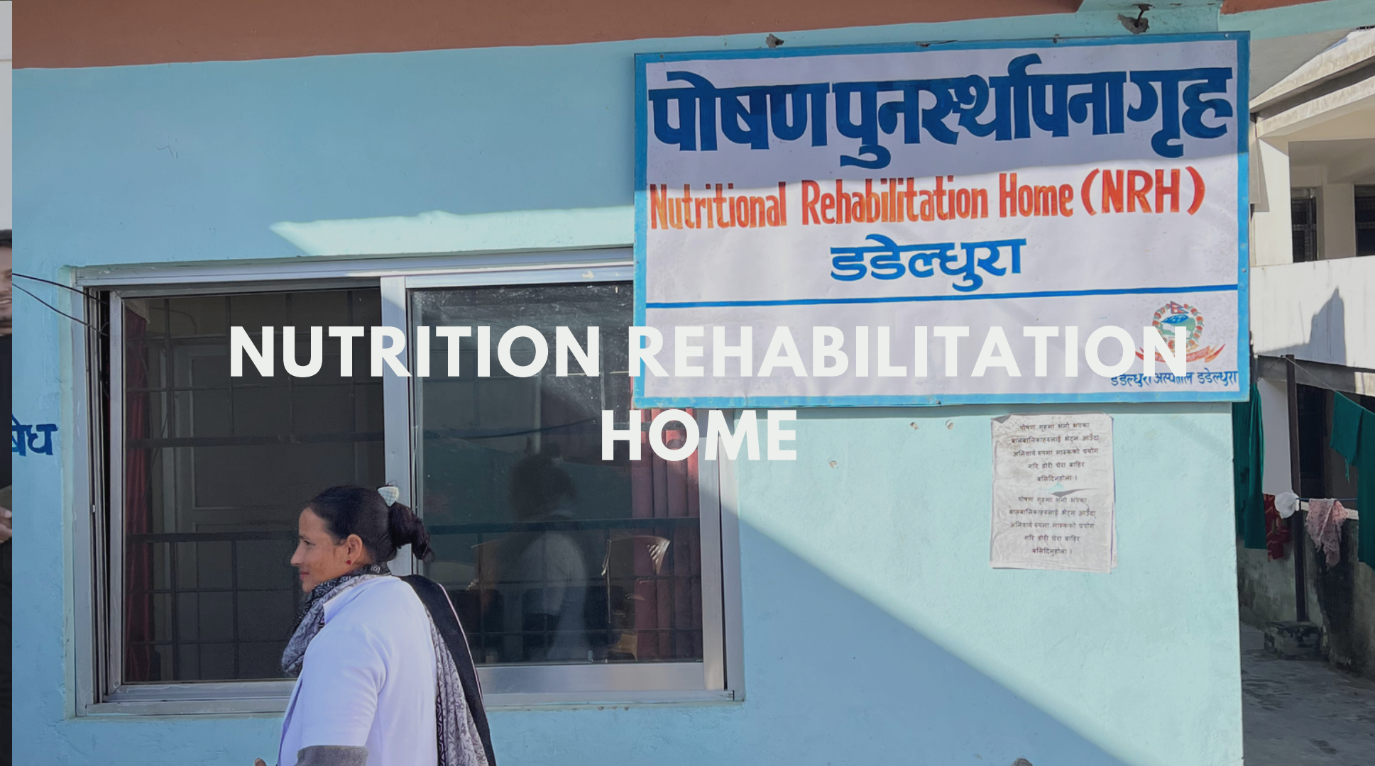
NUTRITION REHABILITATION HOME