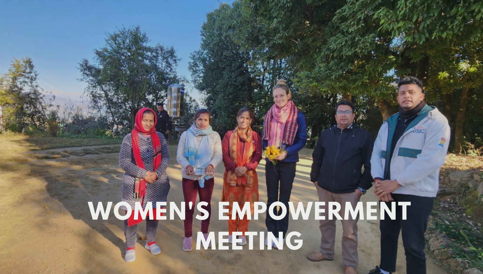
WOMEN'S EMPOWERMENT MEETING