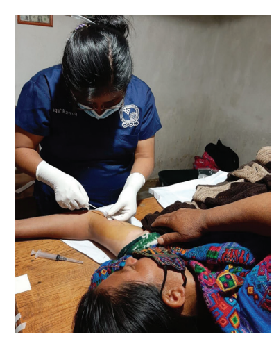
A community-based nurse at Wuqu'Kawoq, one of our global partners, inserts a contraceptive implant into a patient's arm in rural Guatemala

With universal, affordable access to family planning, we can improve people's lives, protect the environment, and forge a healthier, more sustainable future for people everywhere.