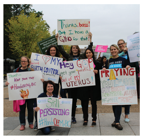
Population Connection staff attend a rally in Washington, DC, to protect access to birth control