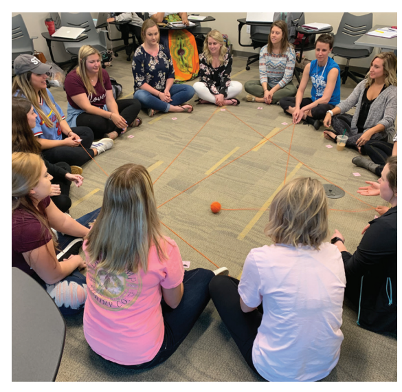
Pre-service teachers attend a PopEd workshop to learn how to use our lesson plans in their classrooms