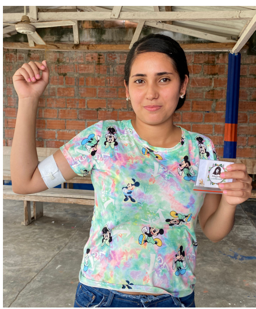
W4C's first family planning event in Puerto Pinzon, Day 1

Many of the women in this community lack access to reproductive healthcare due to financial and transportation barriers. We received feedback from women who are grateful to be able to plan their families in order to pursue education, career opportunities, and join our conservation workshops. Our free and accessible family planning programs have helped many rural women across Colombia and lead to the well-being of our partner communities.