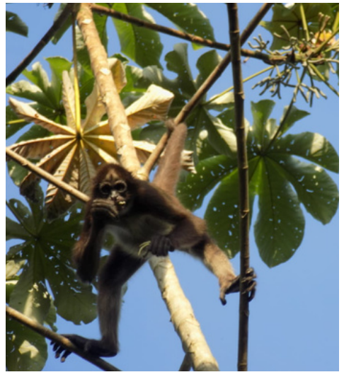
ProAves El Paujil Reserve partners with the local Puerto Pinzón community to protect one of the last known habitats two critically endangered species - the Blue billed-curassow (endemic) and the Brown spider monkey.