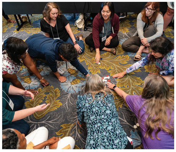
Pre-service teachers attend a PopEd workshop to learn how to use our lesson plans in their classrooms