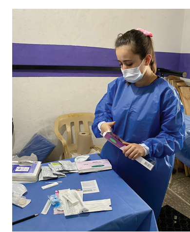
Behind the scenes of a family planning brigade with Women for Conservation (W4C), our Global Partner in Colombia, and W4C's local partner, Profamilia

With universal, affordable access to family planning, we can improve people's lives, protect the environment, and forge a healthier, more sustainable future for people everywhere.