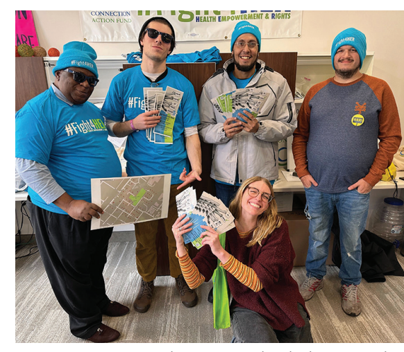
Canvassers in New Hampshire getting ready to hit the streets to do voter education outreach in 2024