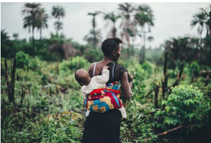
A woman and her baby in Sierra Leone

That path forward necessarily embraces the critical linkages between population and the SDGs, and emphasizes the crucial importance of investing in women and girls.